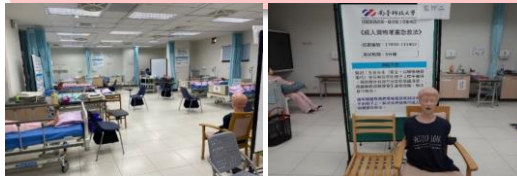
Care Technique Classroom