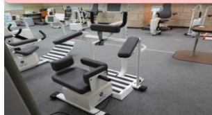
Whole-Body Rehab Equipment