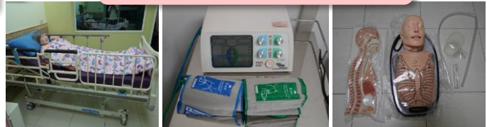
Simulation of Annie