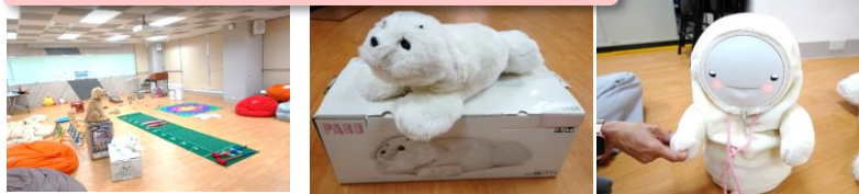
The Multifunctional Classroom